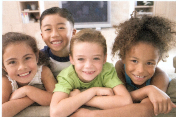
Dana Intake Worker Daughter Sister Aunt